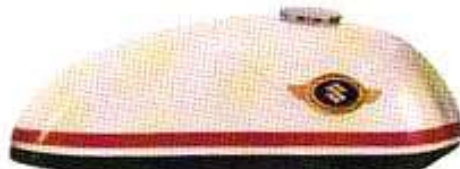
T-350 in Cape Ivory or Redondo Blue with White racing stripe.