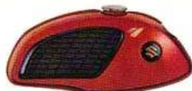
AC-100 in Mesa Orange.