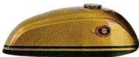
T-500 in Colorado Gold or Mesa Orange with Black racing stripe.