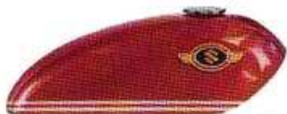
TS-250 in Roman Red or Monterey Green with 2 Silver racing stripes.