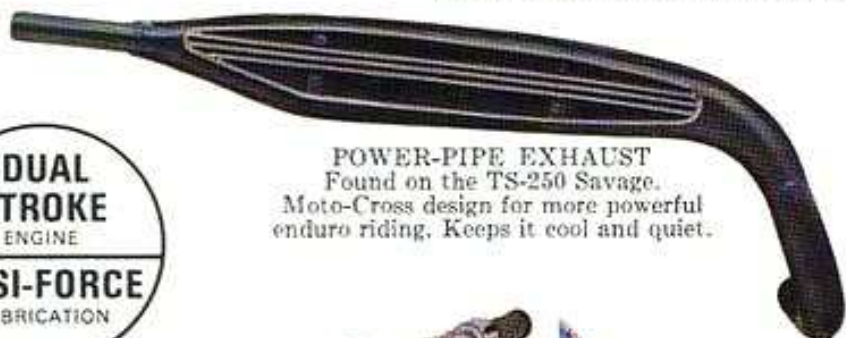
POWER-PIPE EXHAUST Found on the TS-250 Savage. Moto-Cross design for more powerful enduro riding. Keeps it cool and quiet.