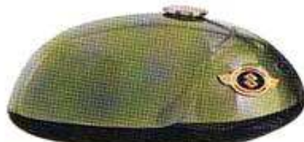
T-250 X-6R in Morro Green or Mesa Orange with Black racing stripe on top of tank.