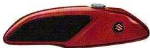
T-125 in Roman Red.