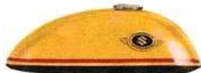
TC-120 in Aspen Yellow with Red racing stripe or Mesa Orange with White stripe.