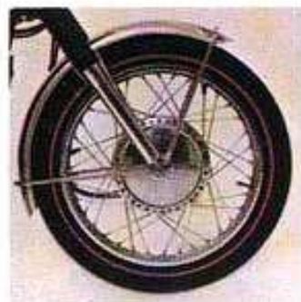
RED-LINED TIRES An industry first! Found only on the T-500 II Titan. Made for fast action.