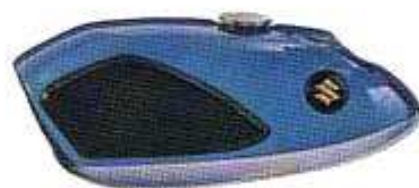
AS-50 in Redondo Blue.