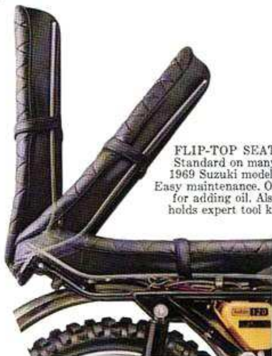
FLIP-TOP SEAT Standard on many 1969 Suzuki models. Easy maintenance. Opens for adding oil. Also holds expert tool kit.