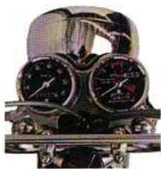
DOUBLE-CHECK PERFORMANCE PANEL Separate cushioned speedometer tach for exact readings at any speed.