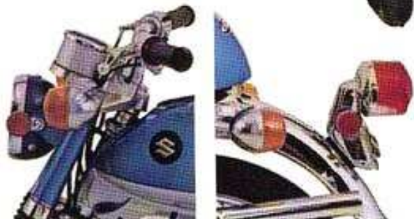
TURN SIGNALS AND SIDE REFLECTORS Bright orange signals front and rear. Orange side reflectors in front. Red in rear.